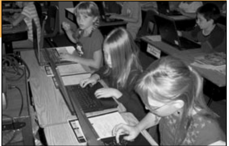
Students work on laptops learning to use technology to enhance each subject area.