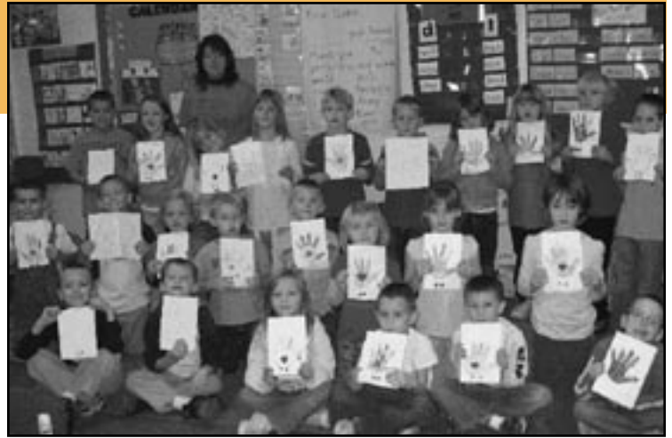
All McFall classes are scheduled to send cards to our troops in Iraq. Mrs. Seifert's first grade class is pictured with their Thanksgiving cards sent to one of their classmate's uncle.