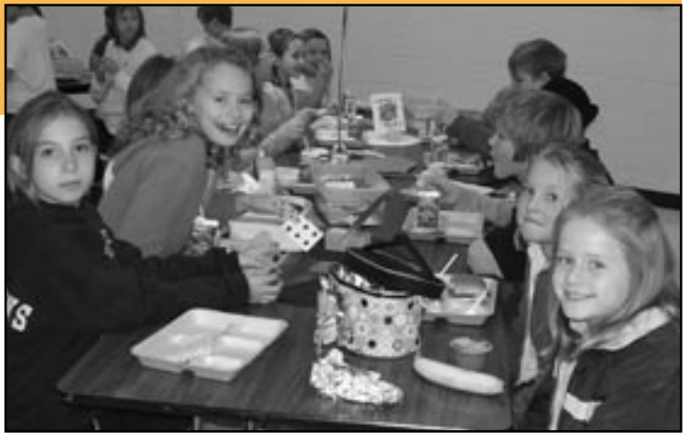
Page students participated in "Mix It Up Day." Lunch times were switched so students had the opportunity to eat with students they don't usually see at lunch and expand their friendship circles.