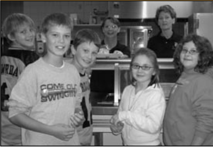
Page students help celebrate National School Lunch Week by showing appreciation to lunch service staff.