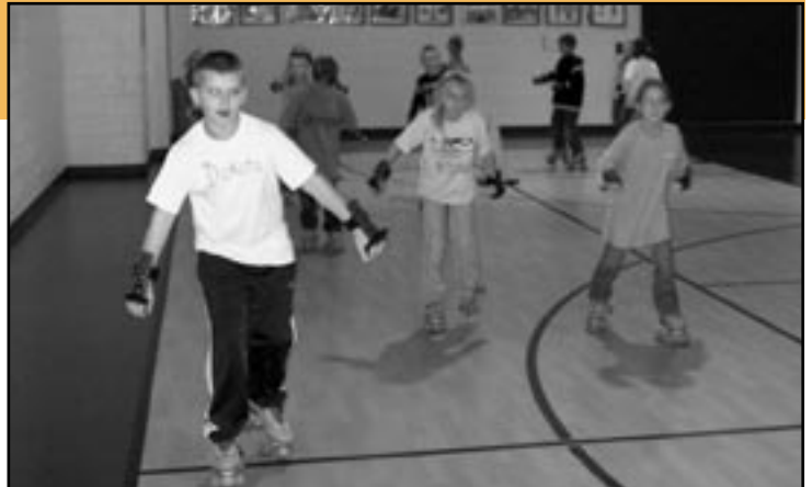
Lee students developing their skills for the annual roller skating field trip.