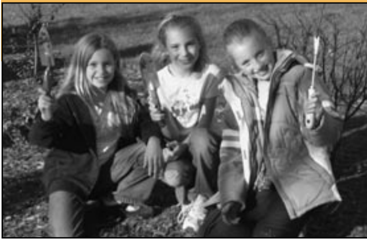
Page Student Council representatives planted bulbs donated by the TK High School Environment Action Council. They are looking forward to next spring when the bulbs bloom.