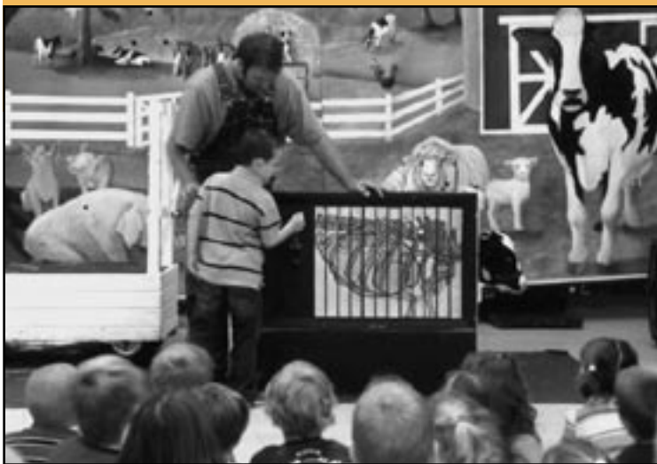
McFall students learned about the importance of farms during a visit by The Barnyard Express.