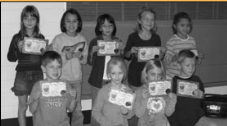
Character Awards: These 2nd grade students earned the Principal's Award for displaying outstanding respect and excellent academic performance.