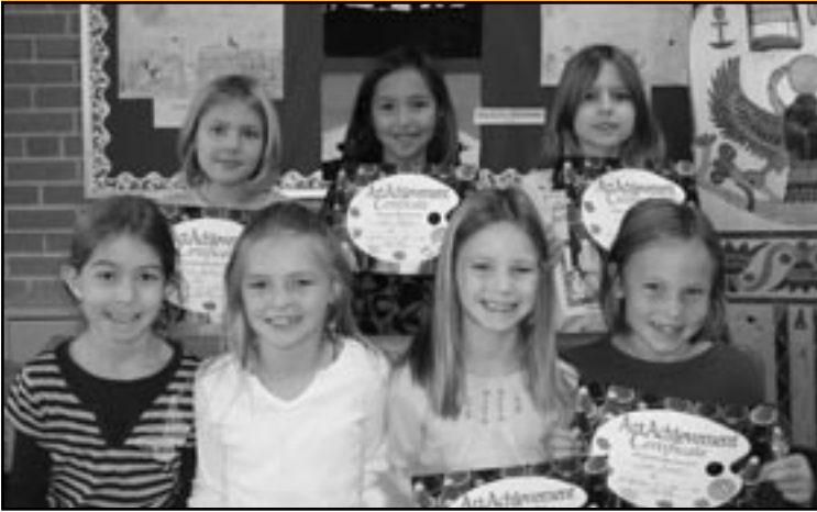
Each week, artists from two classrooms are showcased in the Lee Lobby. Check out the super art!