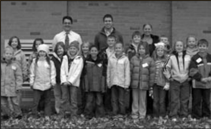
The Lee Student Council volunteered not only their time but also $200.00 to the Barry County Food Bank in November.