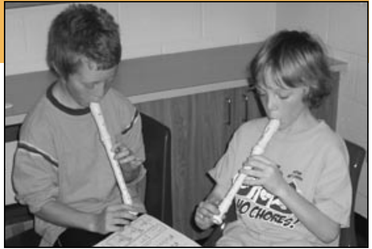
Page students are learning to play the recorder and earning recorder belts as they master songs from their Recorder Karate book. They start with white belts and work through to earn black belts.