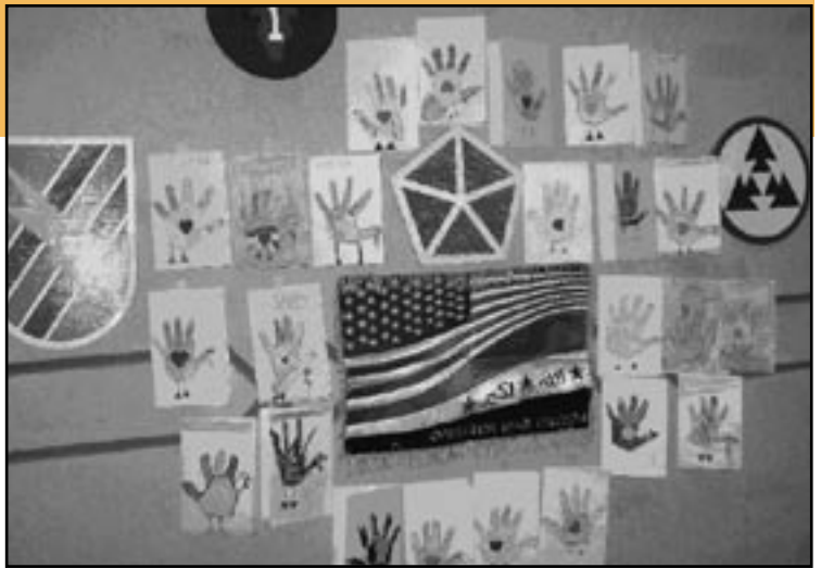
Mrs. Seifert's classroom letters are shown on display in Iraq.