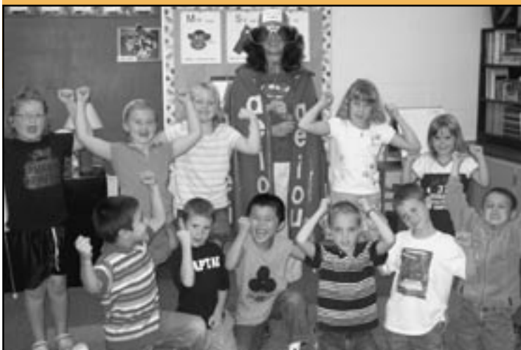
McFall first graders are learning about "Super Vowels."