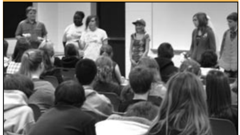
The Willing to Wait drama team consists of High School and college students that have chosen to remain abstinent until marriage. Their skits reiterate the message seventh graders have learned in the program in a fun and encouraging way.