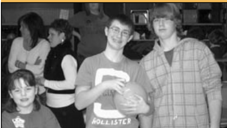
Students in our Cognitively Impaired program enjoyed a couple of games of bowling at the Middle Villa Inn.