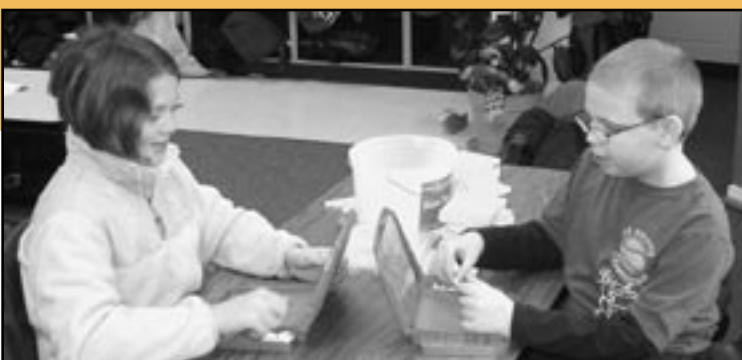
Students from Lee and Page Elementary take part in the TK Connectors program which helps our students with disabilities transition to activities with same age peers. Students meet to play games, eat lunch together and work on various activities.