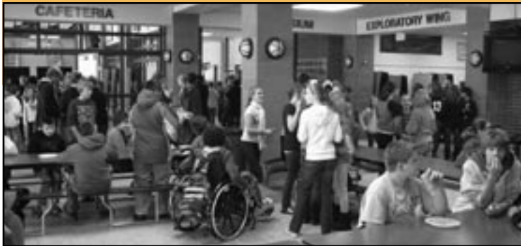
The middle school held its third activity event. This is a time for middle schoolers to come and hang out with their friends after school to play games, dance, and just enjoy some time away from the classroom.